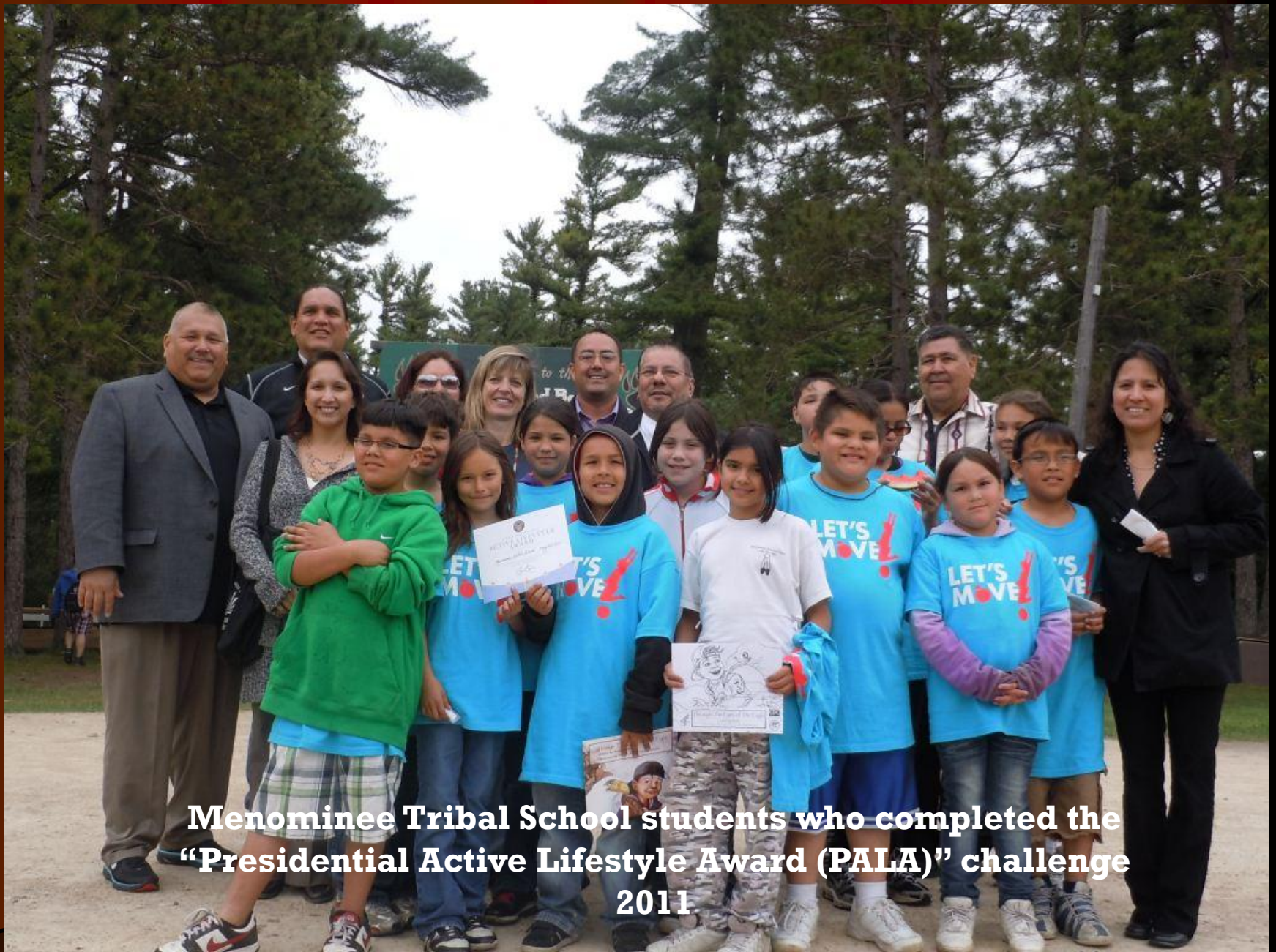
Menominee Tribal School students who completed the “Presidential Active Lifestyle Award (PALA)” challenge 2011.