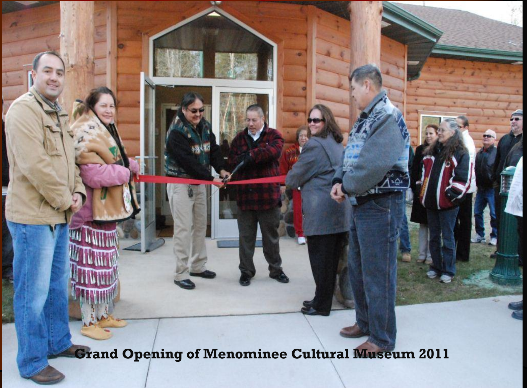
Grand Opening of Menominee Cultural Museum 2011