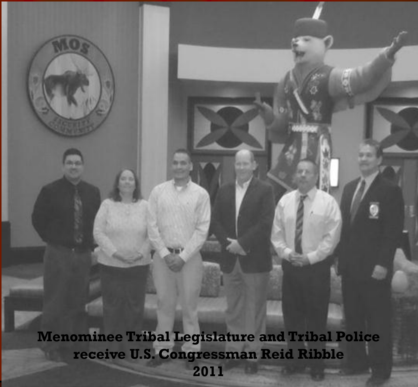
Menominee Tribal Legislature and Tribal Police receive U.S. Congressman Reid Ribble 2011