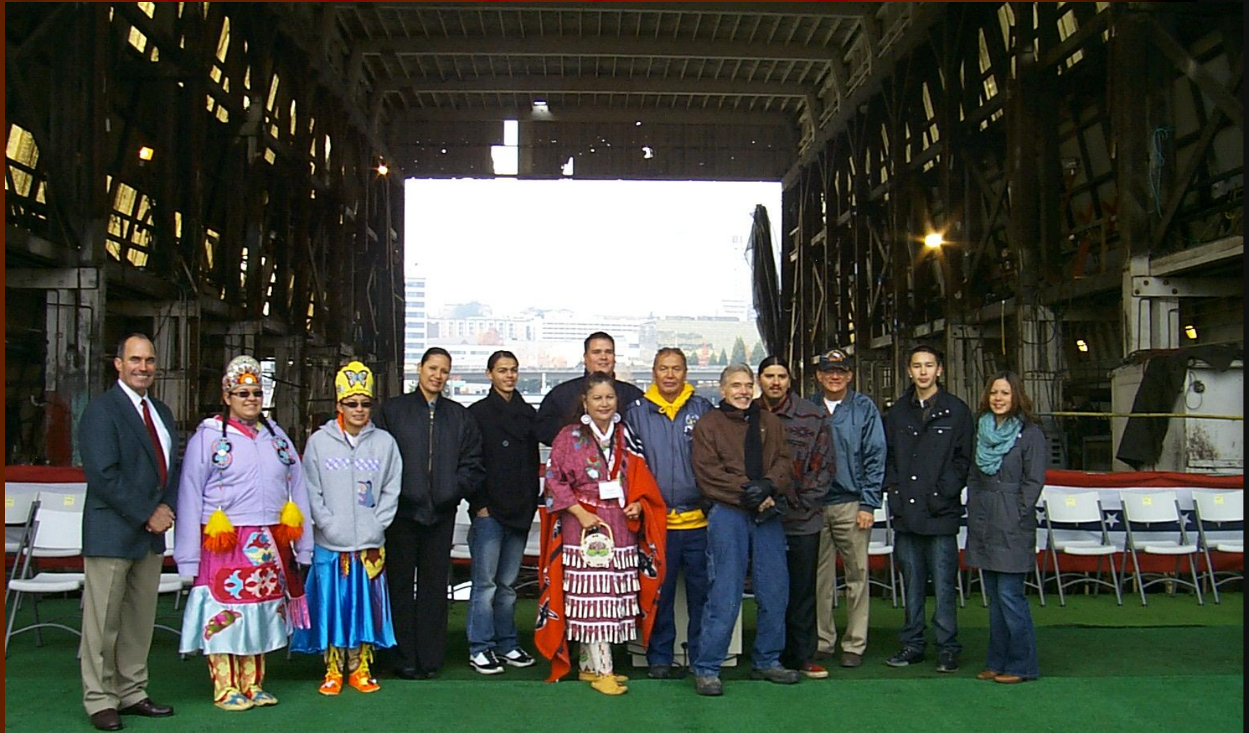
Menominee Delegation and Tribal Members travel to Washington for Christening of Naval vessel “USS Menominee” (YT-708)