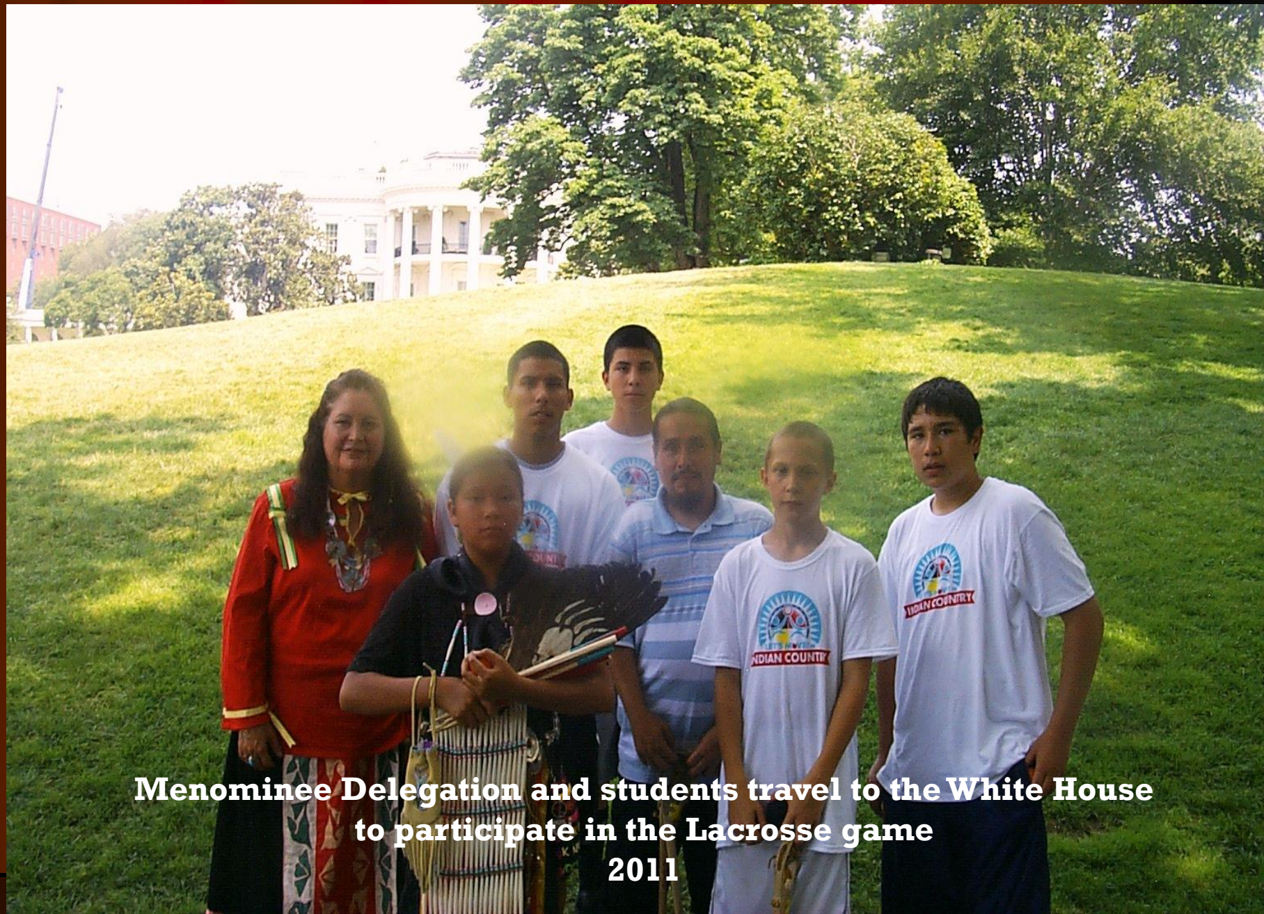
Menominee Delegation and students travel to the White House to participate in the Lacrosse game 2011